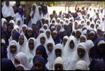
Students in the province of Rokupr

Introduction: After 11 years of internal conflict that lasted from 1991 to 2002, the Country of Sierra Leone is finally beginning to look toward regaining more internal development and stability. There is much to be done. President Ernest Bai Koroma, now into the second year of his presidency vowed during the election campaign to make the youth a priority in his administration. As of this writing, a National Youth Commissioner has yet to be named. There are many issues affecting the population of Sierra Leone. Massive unemployment amongst the youth, poor healthcare including the rising incidence of HIV/AIDS, rising maternal mortality, and unenforceable child labor laws that perpetuate the incidence of children working long hours on the streets. (Many children are unable to attend school due to lack of monetary resources). The influx of western ideology, including the corporate commercial rap culture and it's media have left many young people in Sierra Leone wishing for the false life of the "Bling Bling" culture: money, women, cars, sex and much of the materialistic values that are held in American culture as a whole. Traditional family values, African culture and language are being rapidly replaced.