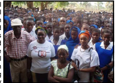
Outreach at Magbema School in Rokupr