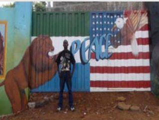
Artist in front of his art work at the God's House clinic

little, if any, consideration paid to the millions of young people who are walking the streets selling their wares, begging, and yes, even digging for diamonds in the diamond field of Kono, diamond country. There are countless numbers of other young women who are uneducated, illiterate and believe they have no other way to make a living except to market themselves in unregulated brothels all over the country. Hundreds and hundreds of workers, many of them children are day by day mining the fields in search of that which will enrich the lives of many - excluding themselves. Within the world of commercial rap "Bling Bling" refers to flash, glitter, material wealth, and relatively speaking, Diamonds; without the "Bling Bling", you are nothing, you're not "in" - you are a nobody. Many wish for educational opportunities, some for employment opportunities while others wish for a break to show the world their talents of art, rap ,dance, ministry, community organizing etc.. Below are some of the stories of the real "Bling Bling" in Sierra Leone: The Youth.