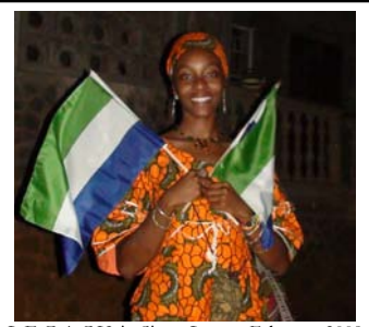
L.E.G.A.C.Y. in Sierra Leone, February 2009